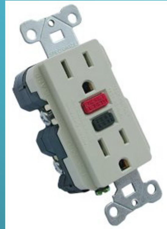
Counterfeit Product & Label (no internal circuitry)