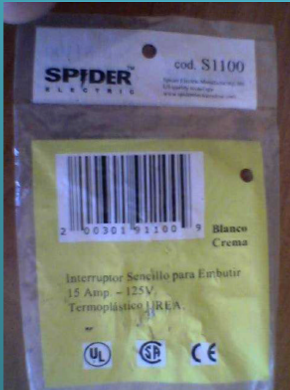
Counterfeit CSA & UL Label & Product