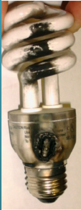
Globe Mini Spiral 13W Unauthorized cUL Label ESA & UL recall